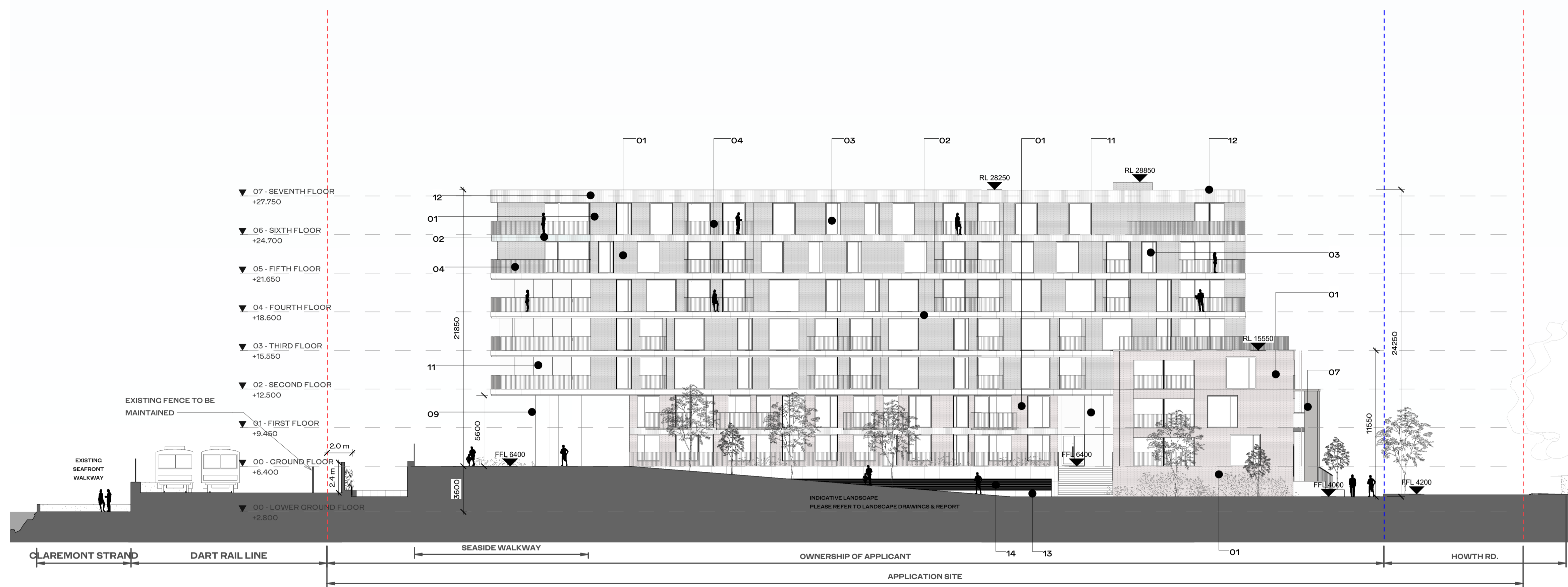
1 BLOCK B - WEST ELEVATION 1:200

Architecture + Interiors henryjlyons.com +353 1 888 3333 info@henryjlyons.com 53-54 Pearse Street Dublin D02 K466